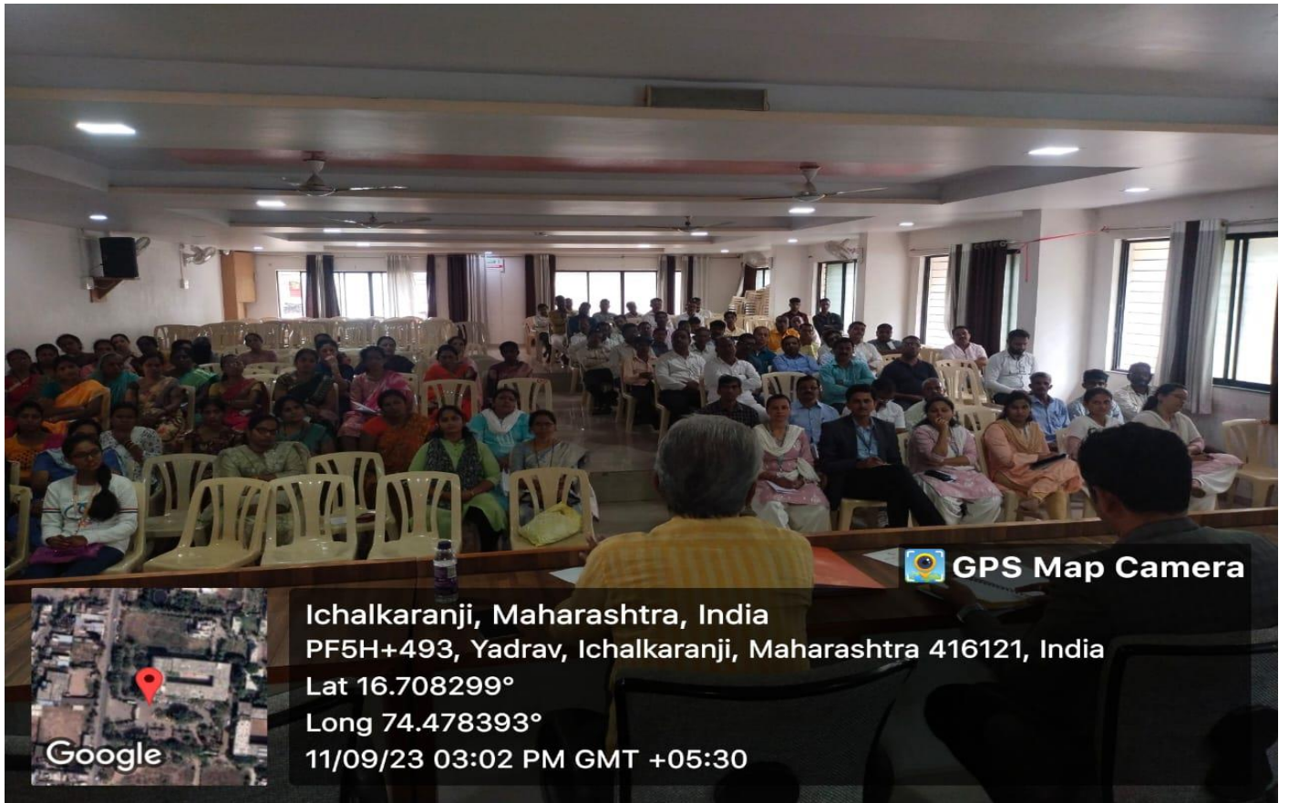
Parents Meet organized by CSE Department