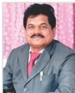
Hon. Shri. Anil Bagane