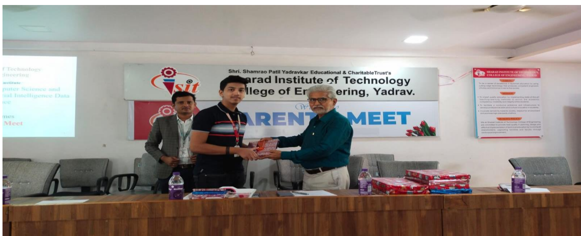
Parents Meet organized by CSE Department