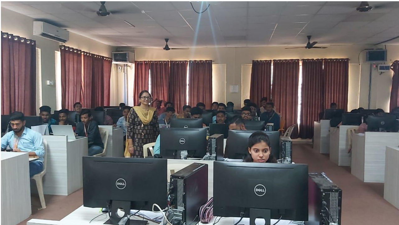
NVIDIA Activity organized by CSE Department

Outcome: Students enable with theoretical knowledge of Emerging Trends in Machine Learning that means basic concepts, Emerging trends in machine learning.