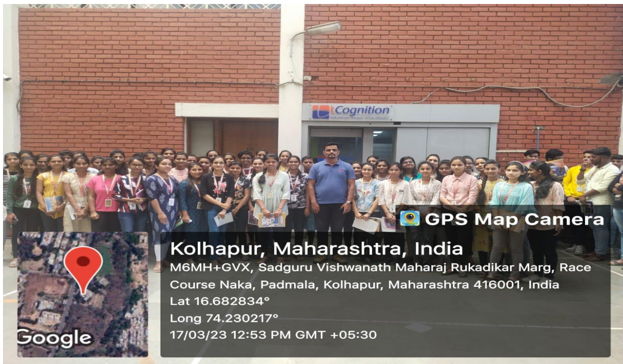
Industrial Visit organized by CSE Department