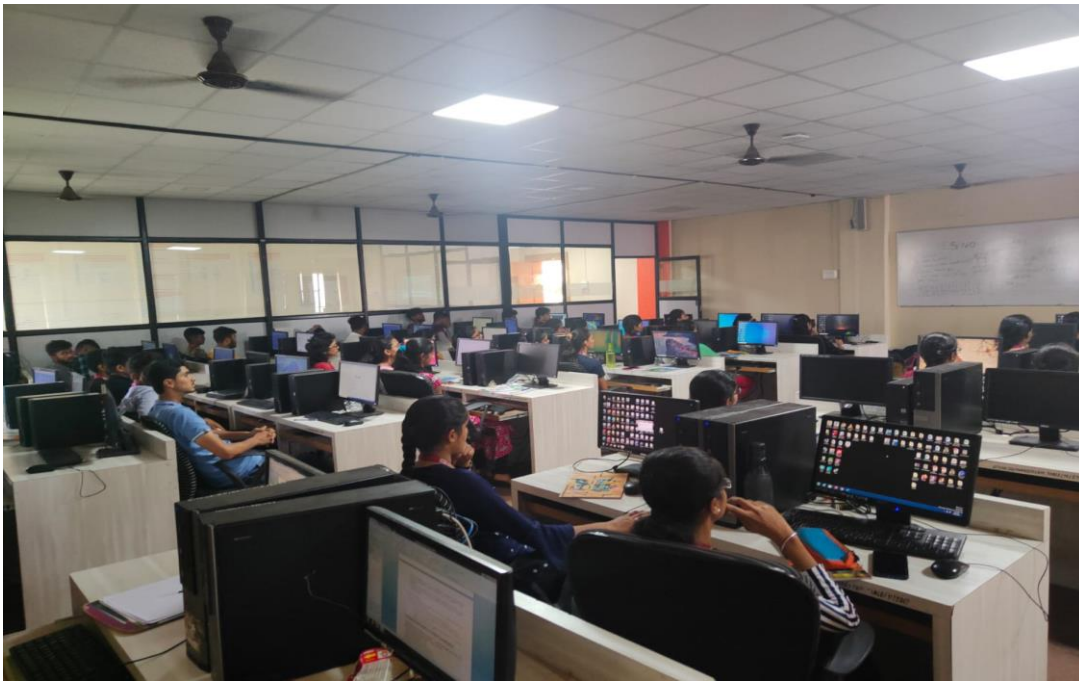
FOSS Activity organized by CSE Department