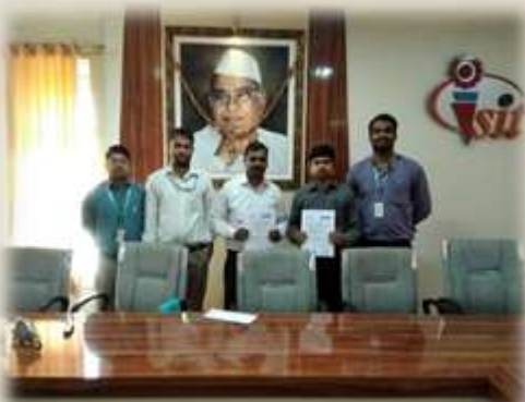
MoU With Syncious, Pune

Photos: Glimpses during sessions on "New Technologies & Industry Readiness"